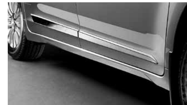
Chrome Accent Mouldings