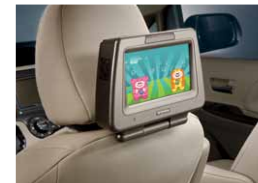
Rear Seat Entertainment System Keep your kids entertained and occupied on those long road trips.