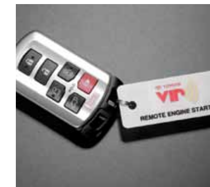
Remote Engine Starter Start your vehicle from as far as 80 feet away to cool or warm it before entry.