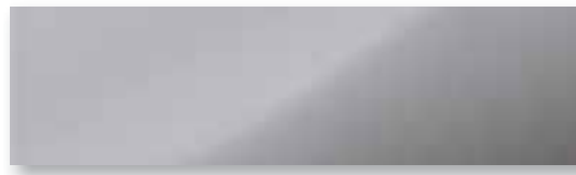
1D6 Silver Sky Metallic