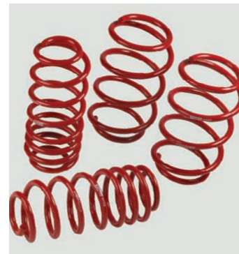
TRD Lowering Springs