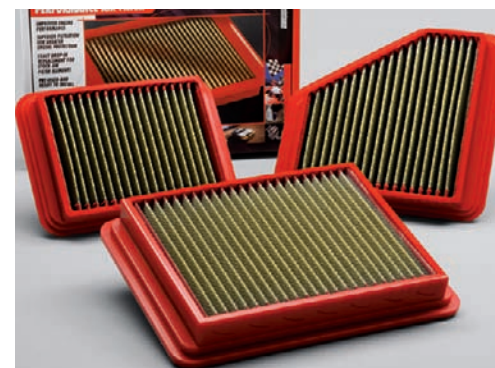
TRD Air Filter