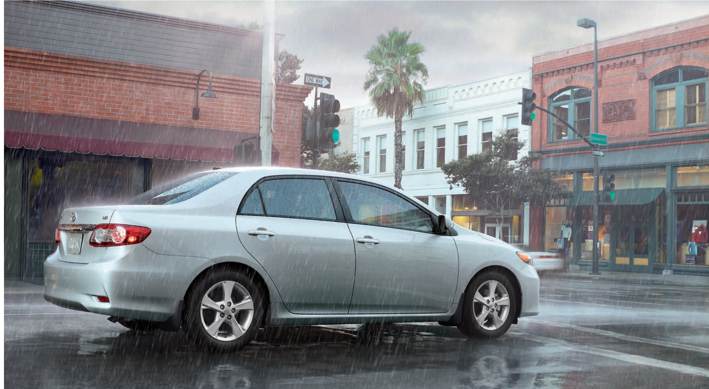
LE shown in Classic Silver Metallic.

To drive the 2012 Corolla is to experience life in the technological fast lane. Simply press the gas pedal and the electronically controlled throttle body triggers your acceleration. The CE, LE and S models are powered by a 1.8-litre 132 hp engine, while the XRS model is outfitted with a 2.4-litre 158 hp engine. And the Corolla achieves a remarkable balance of performance and efficiency, thanks in part to its lightweight aluminum alloy engine block and cylinder head and its Variable Valve Timing with intelligence innovation, which helps the engine to optimize power, emissions and efficiency.