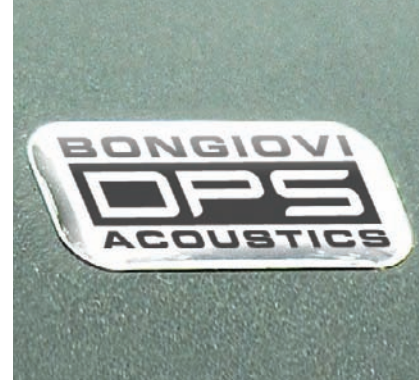
Bongiovi Acoustics DPS Digital audio processor/amplifier system to enhance your audio performance.