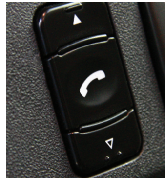
Bluetooth ®3 Keep your hands on the wheel and your eyes on the road as you talk conveniently and safely through the Bluetooth ®3 hands free system.