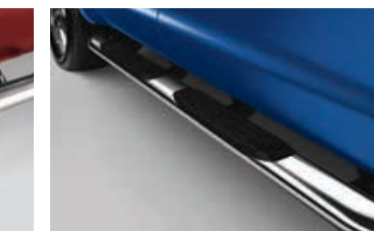
Side Step Bars 5" Chrome