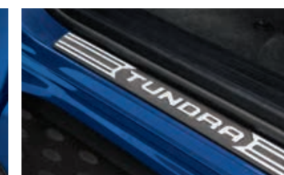
Door Sill Protectors