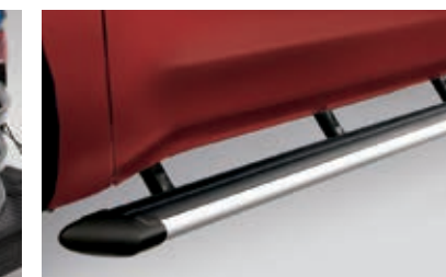
Side Step Bars 4" Oval