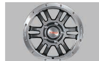
TRD 17" Forged Off-Road Wheel