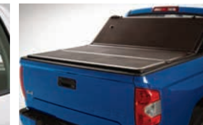
Hard Tri-Fold Tonneau Cover