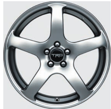
TRD 18" Silver Alloy Wheel