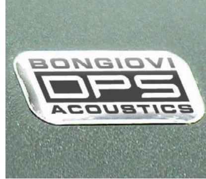
Bongiovi Acoustics DPS Digital audio processor/amplifier system to enhance your audio performance.