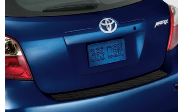
Rear Bumper Protector Protect your bumper from scratches and looking new for years to come.