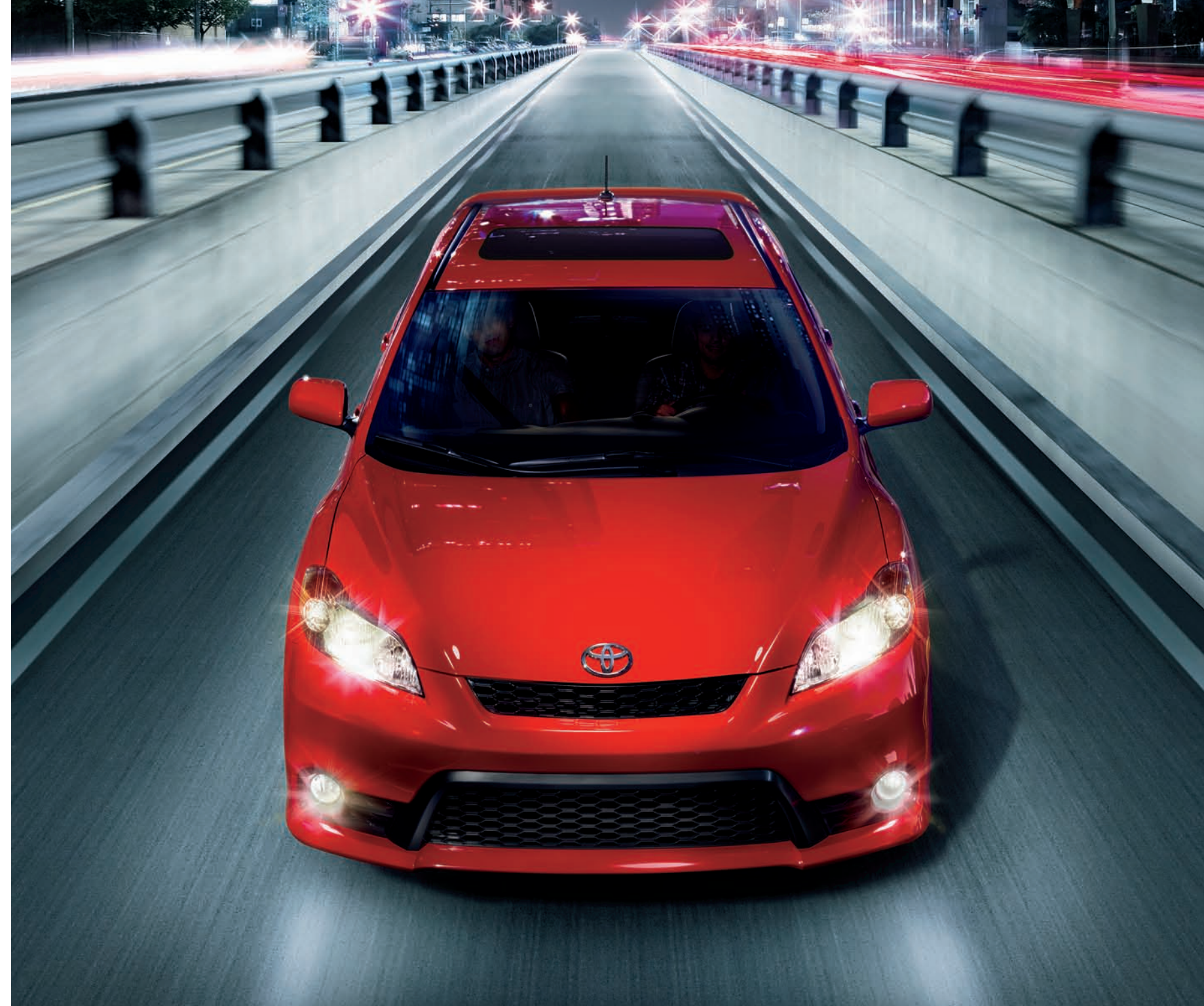
Matrix XRS shown in Radiant Red.

The Matrix AWD and XRS come with an independent Double-Wishbone Rear Suspension that allows each rear wheel to act and react to forces independently. The result? Both rear wheels are kept in maximum contact with the road surface, enhancing cornering grip when driving over rough or uneven road surfaces.