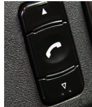
Bluetooth ®3 Keep your hands on the wheel and your eyes on the road as you talk conveniently and safely through the Bluetooth ®3 hands free system.