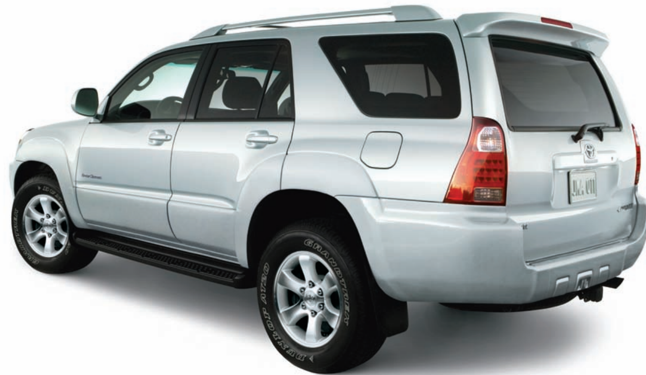
4RUNNER ALL DRESSED UP WITH A FRONT HOOD DEFLECTOR AND A REAR SPOILER.