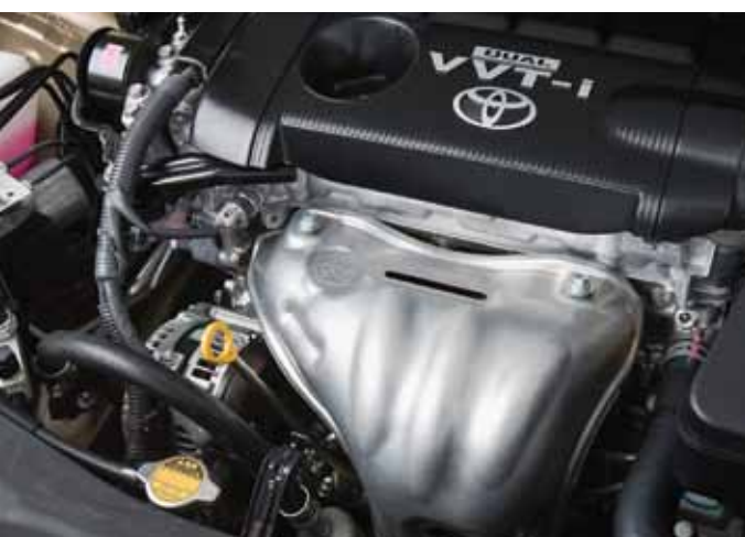
V6 and 4-cylinder engines shown with dual VVT-i.