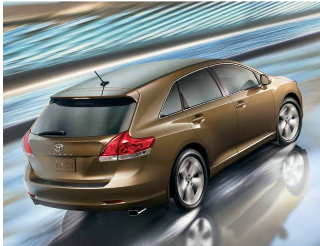
Venza V6 AWD shown in Golden Umber Mica.