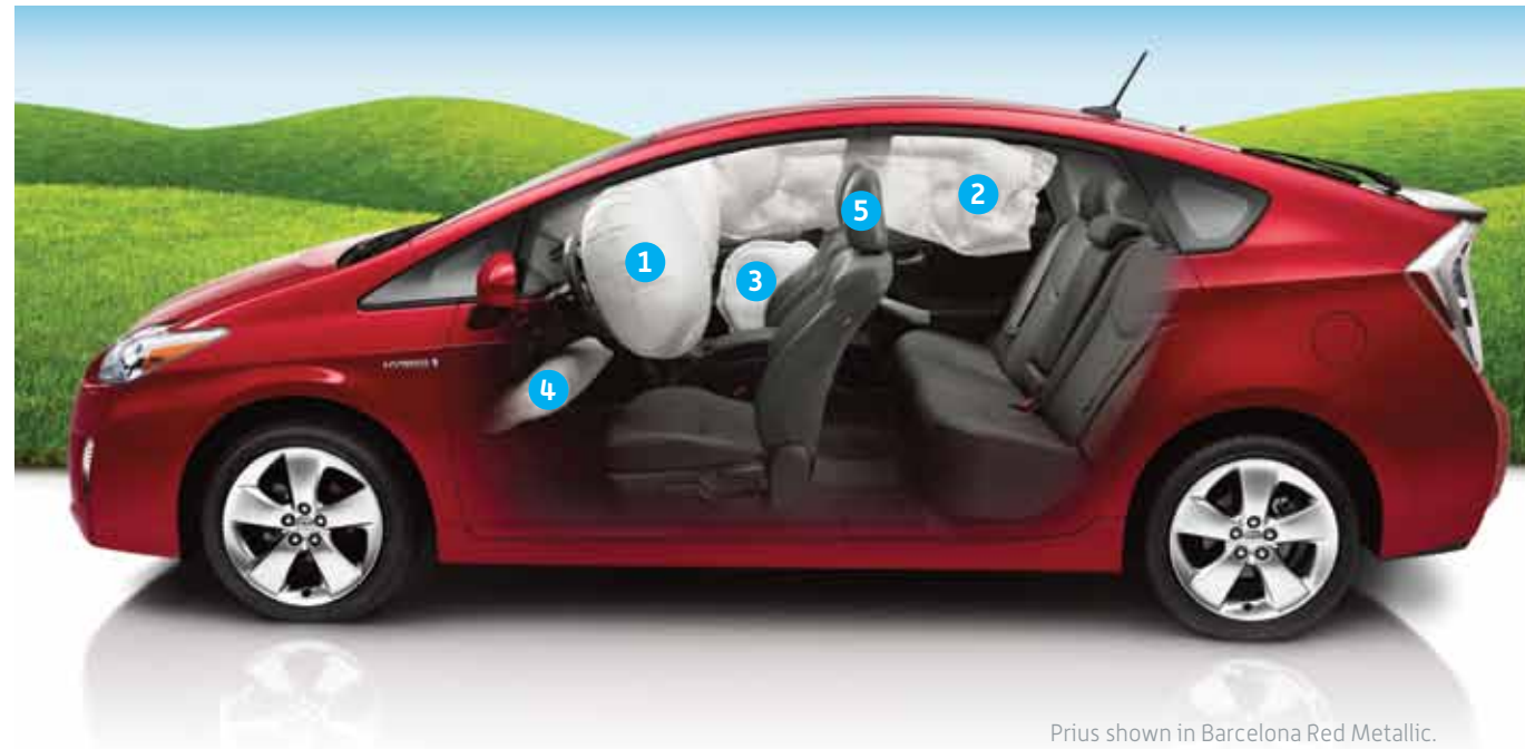
Prius shown in Barcelona Red Metallic.

Toyota is as concerned with your well-being as it is with the planet's. That's why the 2011 Prius features a network of safety features to help protect occupants from almost any angle. Prius comes available with Dynamic Radar Cruise Control, which senses vehicle's ahead and automatically adjusts your speed to allow for a safe and comfortable distance between vehicles. And in the event of an unavoidable frontal collision, the available Pre-Collision System automatically applies the brakes and retracts the front seatbelts to help reduce collision damage.