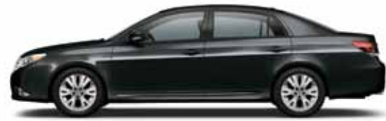
202 Black A