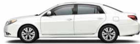
070 Blizzard Pearl A