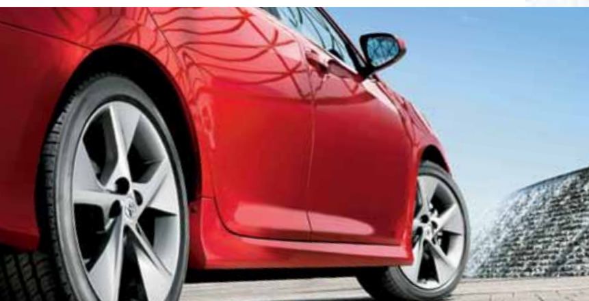
The impressive Camry SE V6 shown in Barcelona Red Metallic.

Heart-pulsing power. Impressive fuel economy. Now you don't have to sacrifice anything with the redesigned 2012 Camry. The 4-cylinder includes a 2.5-litre engine, while the 3.5-litre V6 was engineered to create the exhilarating experience of having power at your control. The Dual Variable Valve Timing with intelligence or Dual VVT-i delivers optimum performance, fuel economy and lower emissions over a variety of engine speeds by constantly adjusting the intake valve timing to meet specific driving conditions.