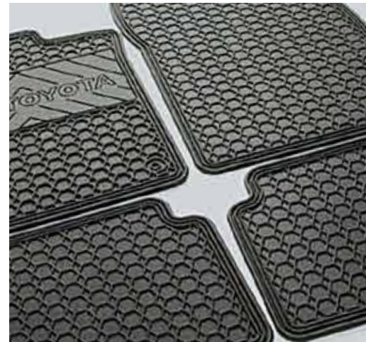
All-Season Mats Safeguard your vehicle's interior against mud, slush and salt with custom-fitted All-Season Mats.