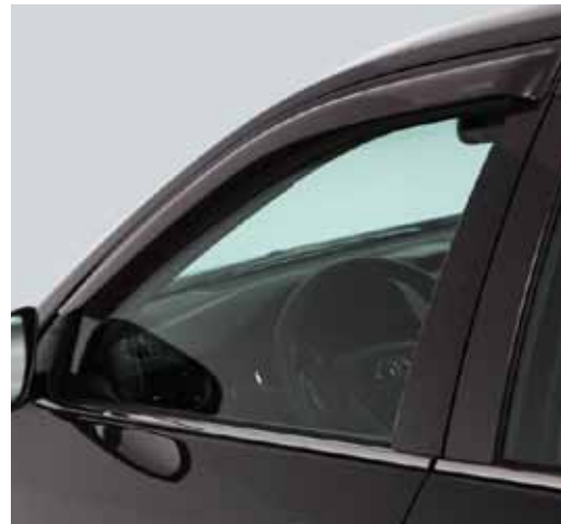
Side Window Visors Keeps elements out while letting the fresh air in.