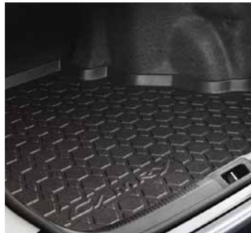
Cargo Liner Protect your interior with this durable vinyl liner which features a raised lip to contain spills for easy cleanup.