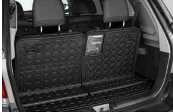
Cargo Liner Protect your interior with this durable vinyl liner which features a raised lip to contain spills for easy cleanup.