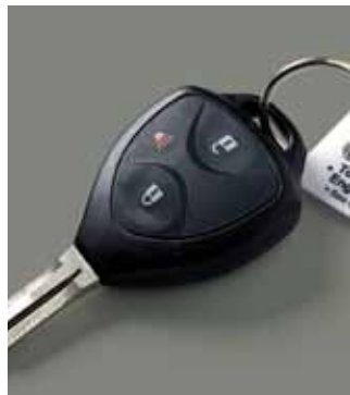
Remote Engine Starter Start your vehicle from as far as 80 feet away to cool or warm it before entry.