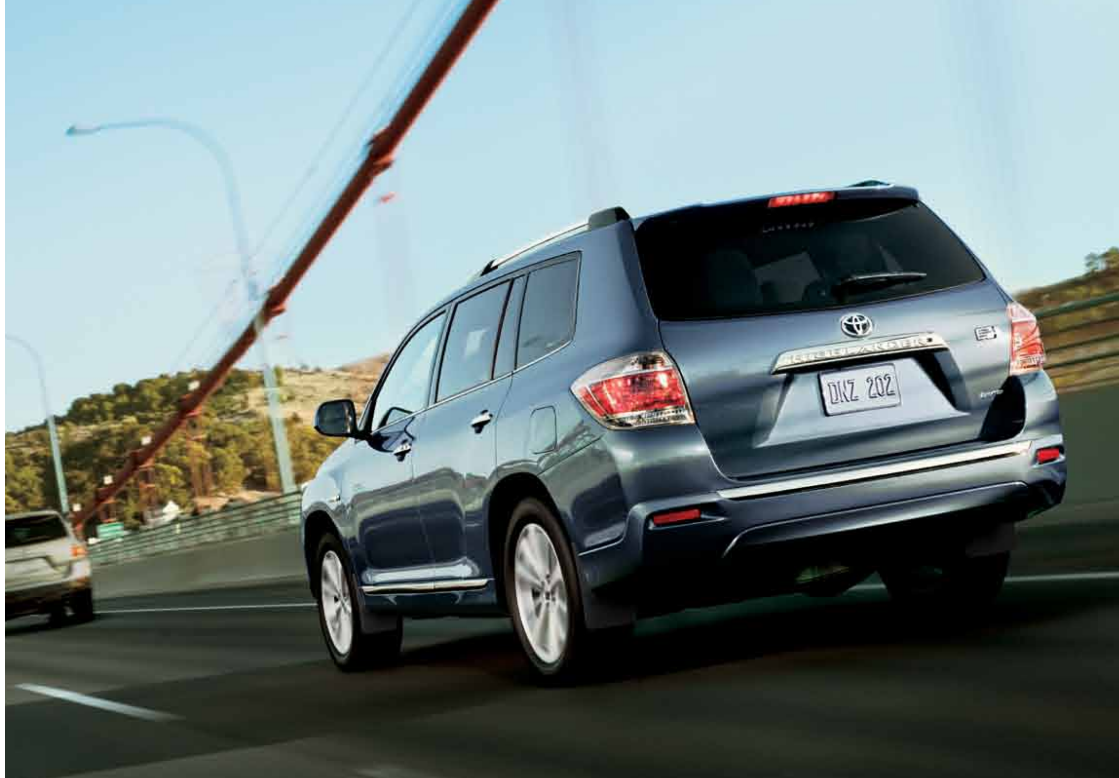
Hybrid Limited 4WD-i shown in Shoreline Blue Pearl.

The V6 gas models come standard with a 3.5 litre, 24-valve V6 engine that delivers 270 hp, and an exceptional fuel economy rating of 12.6/8.7 city/highway L/100km. 2 The Hybrid 3.5 litre 24-valve V6 engine combined with the front and rear electric motors delivers 280 hp and a fuel economy rating of 6.6/7.3 city/highway L/100km. 2