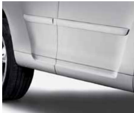
Bodyside Mouldings Protect your vehicle from dings and bumps. Mouldings are custom styled to accent your vehicle's exterior.