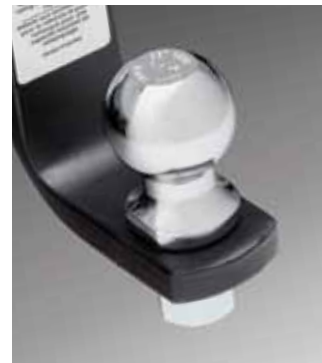
Towing Accessories Haul with confidence with a towing hitch.