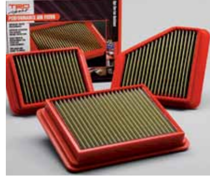
TRD Air Filter