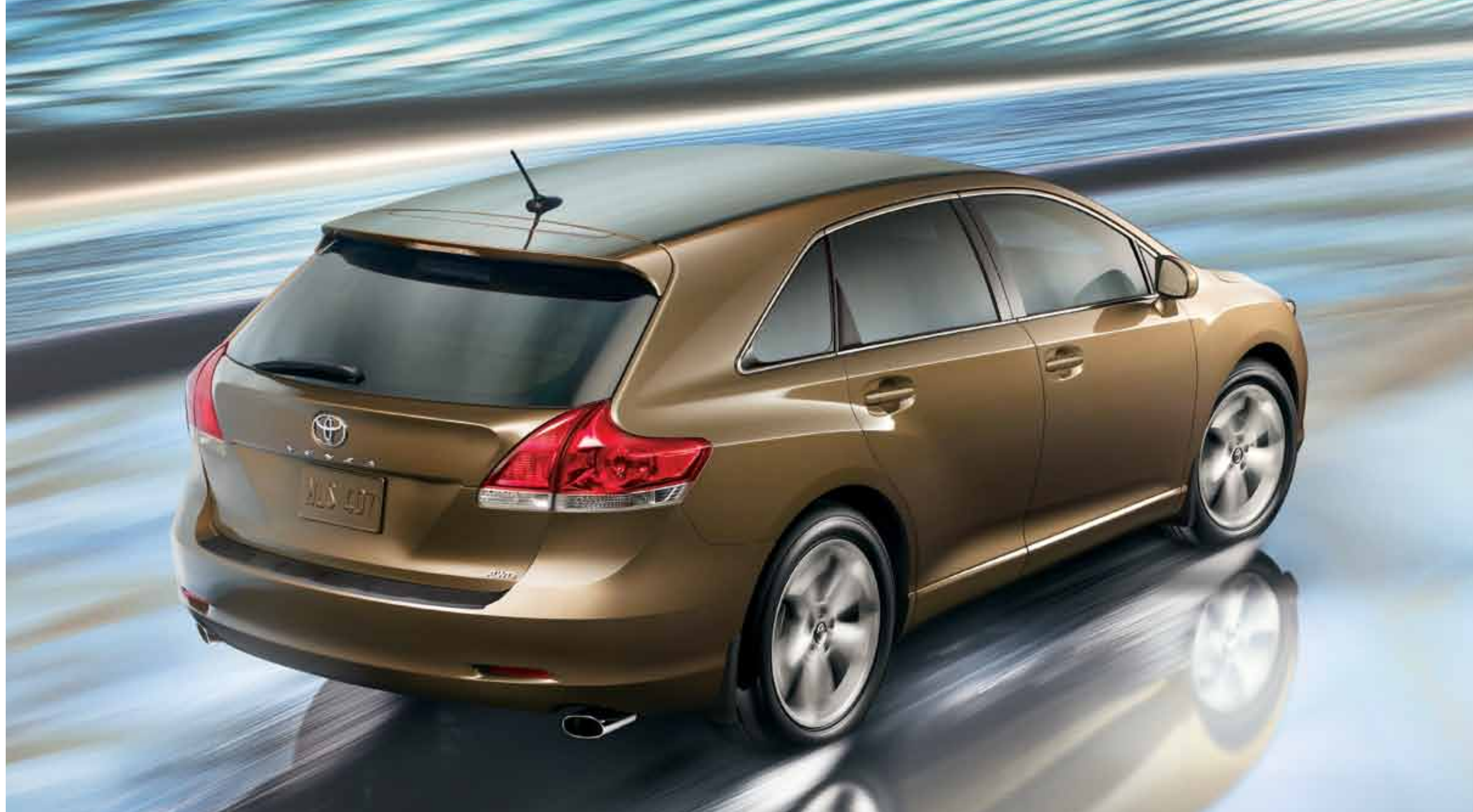
Venza V6 AWD shown in Golden Umber Mica.

To create Venza, Toyota engineers knew they would need to elevate performance across a wide range of criteria. The 182-hp 4-cylinder and 268-hp V6 engines are mated to a 6-speed Super Electronically Controlled Transmission that helps manage the engine's power, so Venza can offer smooth, seamless shifts and excellent fuel efficiency.