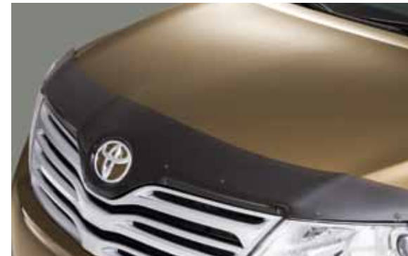
Hood Deflector Protect your vehicle with a high impact deflector that minimizes damage caused by road debris, pebbles and insects.