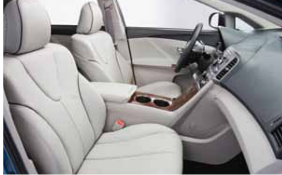
Leather Seat Surfaces (Heated Front Seats)

Hood Deflector Leather Seat Surfaces (Heated Front Seats) Remote Engine Starter Roof Rack