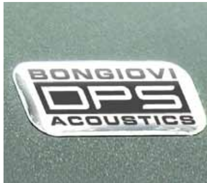
Bongiovi Acoustics DPS Digital audio processor/amplifier system to enhance your audio performance.