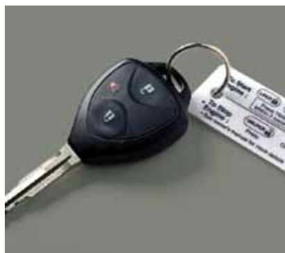
Remote Engine Starter