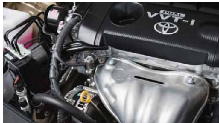
V6 and 4-cylinder engines shown with Dual VVT-i.

The 4-cylinder and V6 models also come available with Toyota's Active Torque Control AWD System. It actively controls each wheel to help optimize the available traction by distributing the engine's torque to just the right wheels at just the right moment.