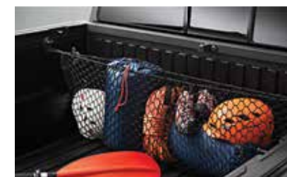
Cargo Net - Envelope