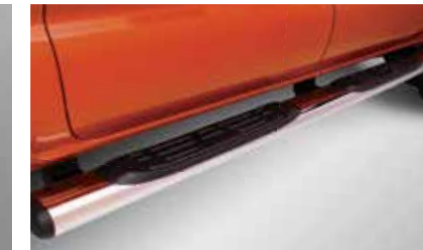
Side Step Bars - 5" Chrome