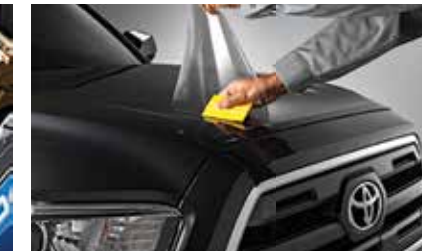
Paint Protection Film