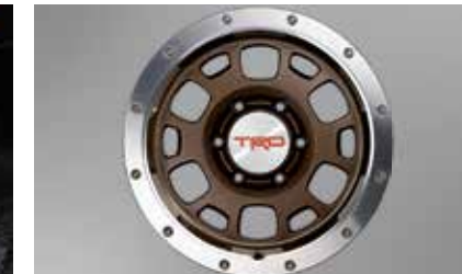
TRD 16" Off-Road Alloy Wheel